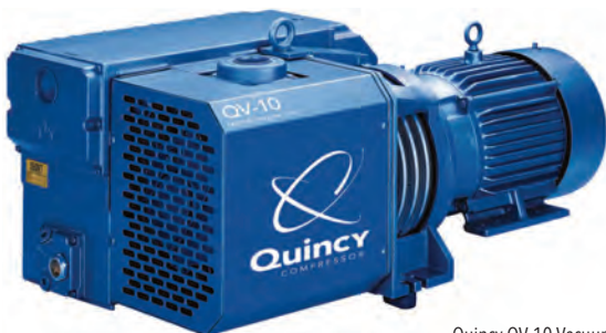
Quincy QV-10 Vacuum

Outside of a yearly oil and filter change, there are no other items that require routine servicing. Our non-metallic vanes are designed to have a service life of at least 35,000 hours. This adds up to more service life between overhauls.